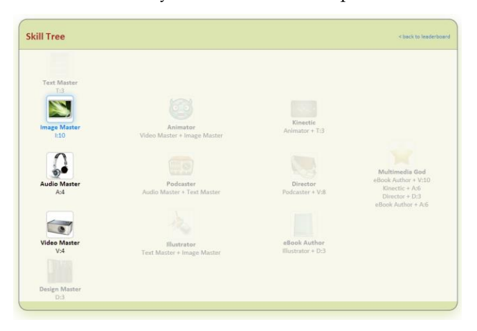
Fig. 2. The MCP Skill Tree.

There is a special kind of achievement that comprises participating in the MCP Quest, an online treasure hunt where students start from a webpage with a multimedia artifact, which they have to edit and manipulate to find the