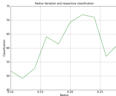
Fig 3. Classification % vs Clustering Radius

To assess the quality of the results, we used two different measures: the percentage of correctly grouped documents and the Silhouette Coefficient (SC) [7] that gives us an estimate of how independent the clusters are from each other. Values between 0.7 and 1.0 indicate an excellent cluster separation, values between 0.5 and 0.7 a medium separation, and lower values show that the clustering process yielded poor results.