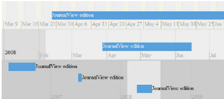
Fig. 2. Newspaper timeline