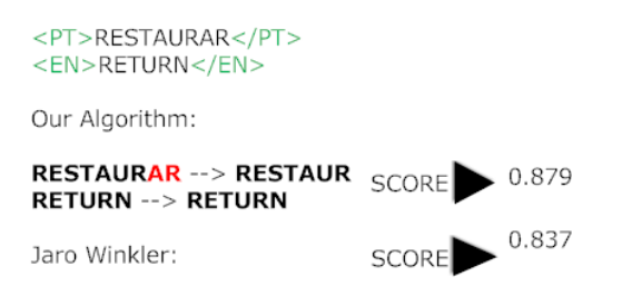
Figure 2: an example where our algorithm fails for a threshold of 0.857. That pair of words is considered a translation using our algorithm, but a mistranslation when using the Jaro Winkler distance.

words that happen to have a small common prefix with the new generated word. For example: