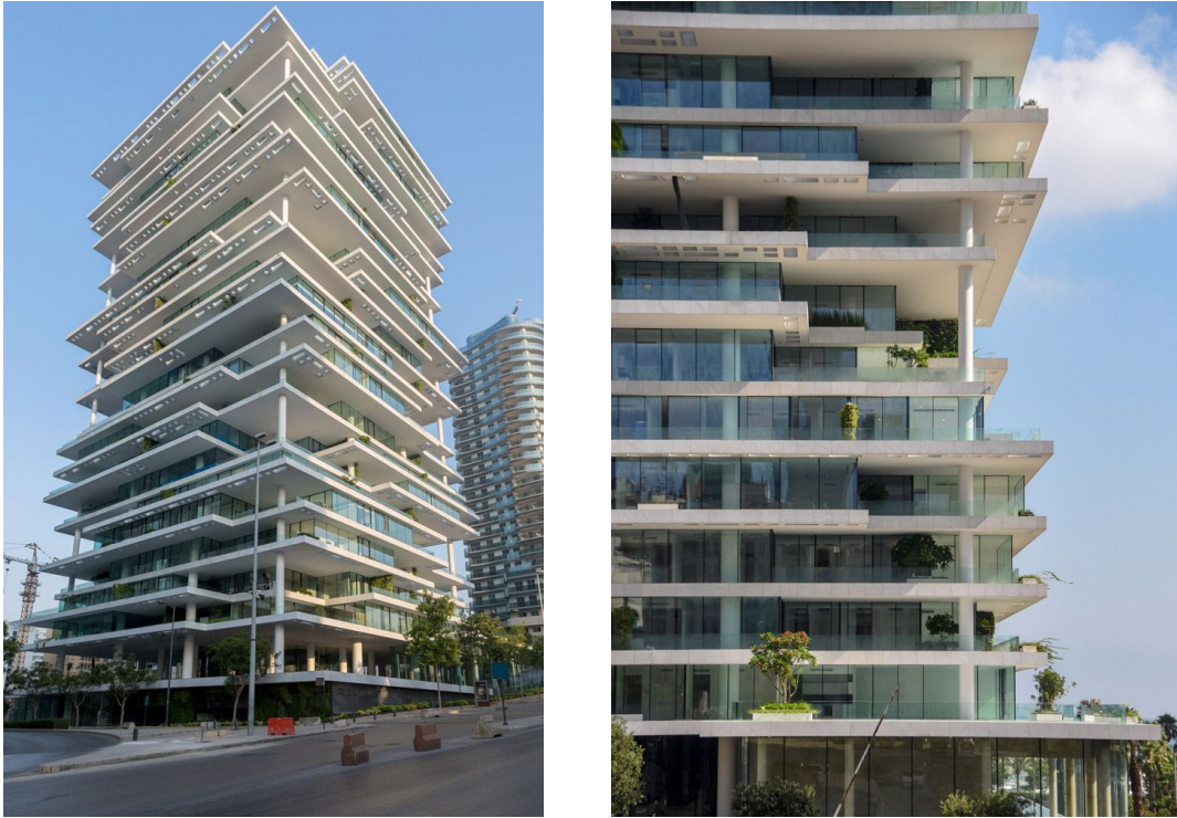
Figure 1. Beirut Terraces , by Herzog & de Meuron.