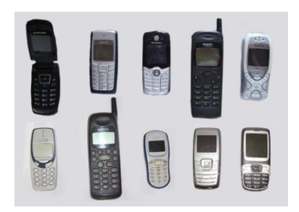
Figure 2 - Mobile devices used in the evaluation

differences between blind people are likely to have a wider impact on their abilities to interact with mobile devices than among sighted people. Tactile sensitivity, spatial ability, short-term memory, blindness onset age and age are mentioned as deciding characteristics for a blind user mobile performance.