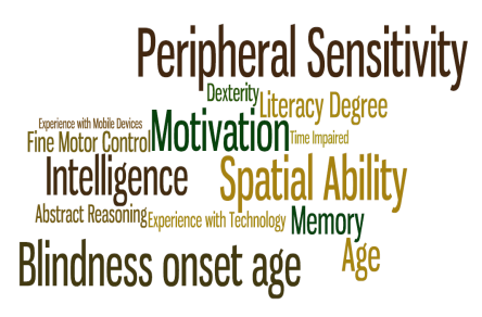
Figure 1 – Individual attributes relevancy

In this sense, the most relevant individual differences (Figure 1) within the target group were gathered in a previous experiment [1] where we interviewed several professionals (psychologists, occupational therapists, rehabilitation technicians, and teachers) that work daily with blind users. These have shown that individual