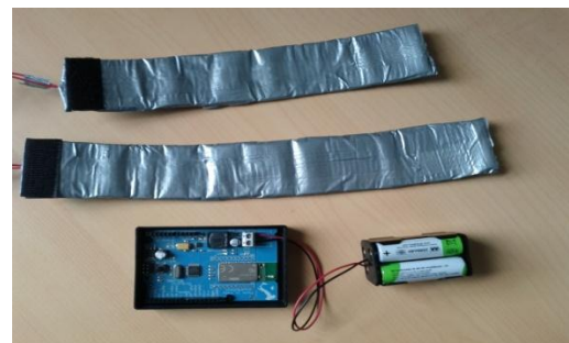
Figure 2 – The guiding system: Two wrist bands with vibration actuators connected to a bluetooth Arduino card.

In the second study, we asked participants to walk in a straight line towards an endpoint. They performed the task without any EOA (just with a white cane) and with a mobile device in their hand. In the latter, a wizard-of-Oz approach was applied: whenever the user deviated more than one meter from a predetermined walking corridor a vibration stimulus was issued by the evaluation monitor. Two different patterns were used (one for left and one for right) and they were employed within two different metaphors: 1) magnetic, where the stimulus meant that the user was required to shift to the indicated direction, and 2) corrective, where the stimulus indicated that the user was hitting a virtual barrier and should correct his path to the opposite direction. The patterns issued were similar as the ones reported by [4] each composed as two different length vibrations (one short followed by one long and vice-versa for right and left, respectively). Results suggested that vibrations could help the user maintain their path but patterns were sometimes confusing. This reinforced that walking an unknown path is a demanding and stressful task and the cognitive load should be reduced to a minimum. Concerning the meaning of vibration, the magnetic